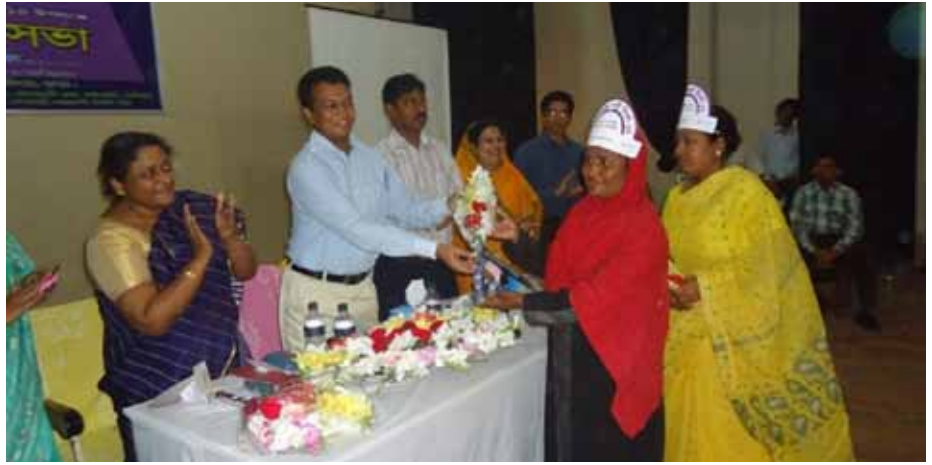
Photo Display: A photo display booth was set in the District Shilpokola Academy Auditorium, Jessore, by EMPHASIS and its partner organization. IEC/BCC materials were displayed for audiences showcasing the interventions and glimpses of the women empowerment activities in field. Large number of audiences having observed the photo display booth.